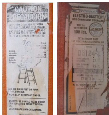
Examples of faded and deteriorated labels

Appropriate storage, maintenance, and oversight of their rental products is the sole responsibility of the rental company. When a ladder is rented all warning labels and usage information should be clearly visible. Faded and deteriorated or missing warning labels have been the cause of serious injuries to renters. Rental agencies should keep and maintain their ladders under cover, not left out in the open environment exposed to the elements. If a rental company fails to inquire the desired usage from all renters and offer safety related equipment such as harnesses and lanyards when long ladders are rented, the rental company is failing to protect that renter.